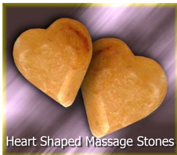
Heart Shaped Massage Stones

While there are many ways you can presently use Samadhi Salt Stone Massage Bars with the Salt Stones Warmers including skin exfoliation and detoxification, mini salt scrubs, cellulite treatments, skin conditions, etc., we are currently working with massage and esthetic professionals and developing our own unique protocol. This will be ready early Spring of 2008 and will include a complete manual along with a DVD to follow. Please sign up on our web site or call 812-303-0701 in early 2008 for more details. We are also very interested in your use of Salt Stone Massage Bars in your own practice and would welcome any feedback.