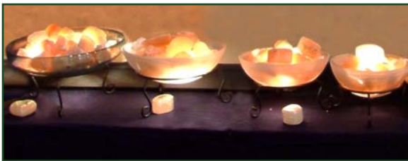
Assorted Salt Stone Warmers

While hot stone massage is an established bodywork modality, Salt Stone Therapy/Massage is new and still in its infancy. Salt Stones may be used in hot stone therapy especially when the therapeutic aspects of salt may be needed or the energy properties of the salt crystal is warranted- Reiki for example. Of course, salt bars may eventually pit or corrode on the surface and can't be warmed to the exact temperatures of hot stones with water heated bathes but with their therapeutic, crystal and sanitary properties, they have advantages which are not present in traditional hot stones. Not the least of these is the anti-microbial nature of salt, which can quickly kill almost all viruses, bacteria, and fungi in short order. Please check our web sit for updates on unique ways to use Samadhi Salt Massage Therapy in your practice.